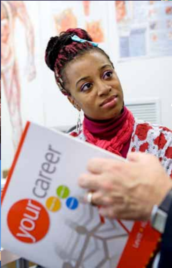
New Bridge CCAT