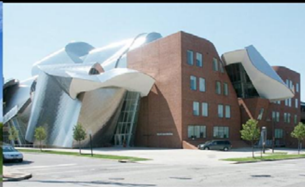
CASE WESTERN RESERVE UNIVERSITY $350 Million