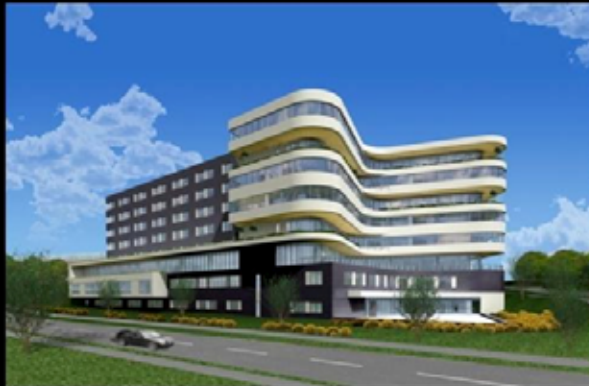
Veteran's Affairs Medical Center $300 Million