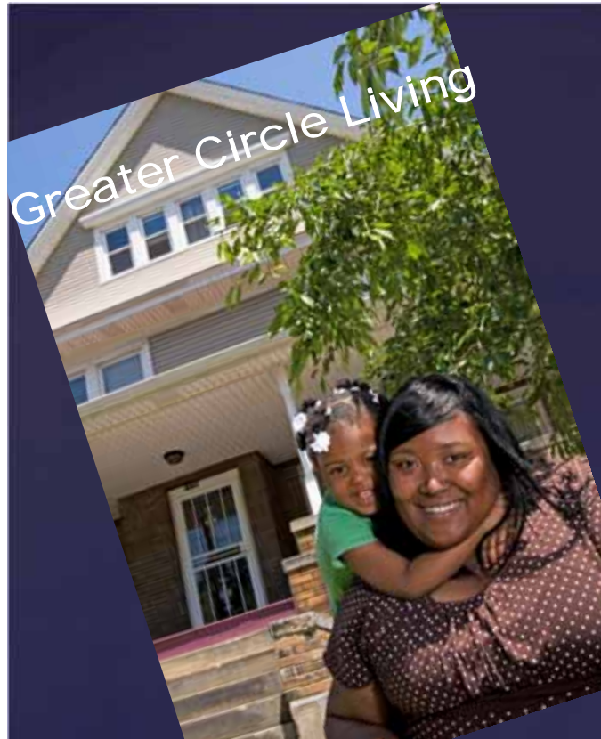
Greater Circle Living