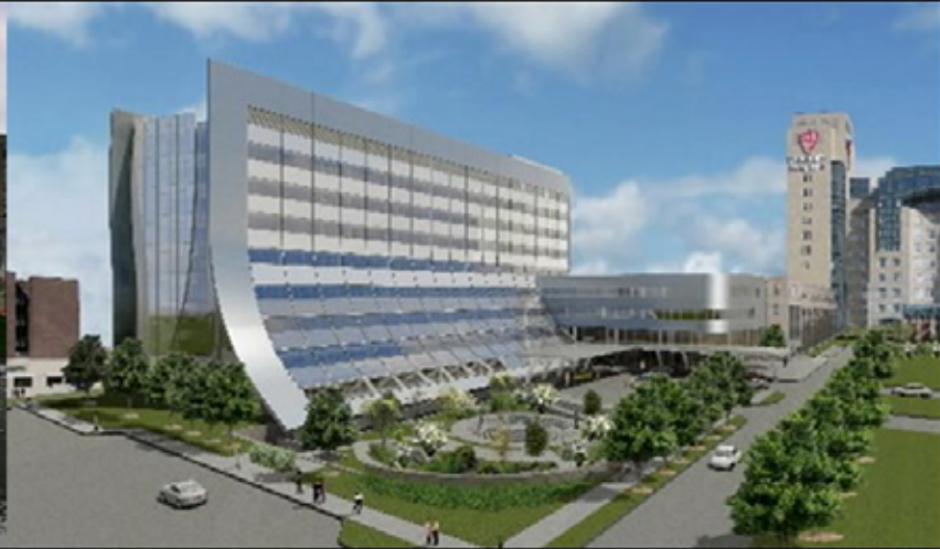
University Hospitals - $1 Billion