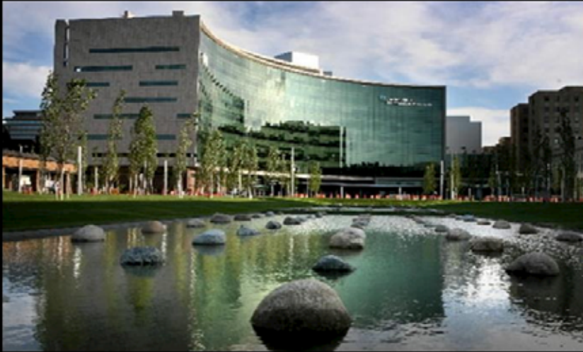
Cleveland Clinic - $1 Billion